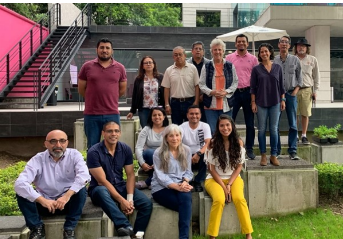
Technical training for fisheries authorities focused on R-programming, Summer 2019.

The goal of the FishPath process in the Huachinango fishery is to address systemic barriers that prevent the finfish fishery to transition towards sustainability. These barriers are shared among other small-scale fisheries and therefore, the process can be replicated with other resources.